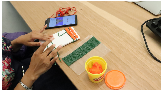
Figure 1: The image above shows a participant using Wikki Stix (green) and Play-Doh (orange) to reconstruct the smart-phone web Google homepage.